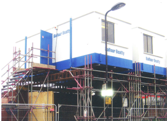
Balfour Beatty – Hackney CDC Centre