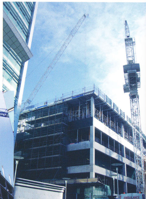
BCJV – EGA Wing