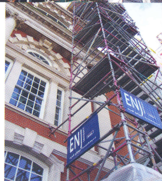
Multiplex – Manresa Road