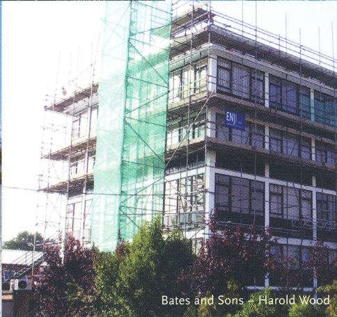
Bates and Sons – Harold Wood