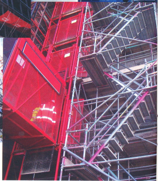
Gleeson – Edmonton Green shopping centre