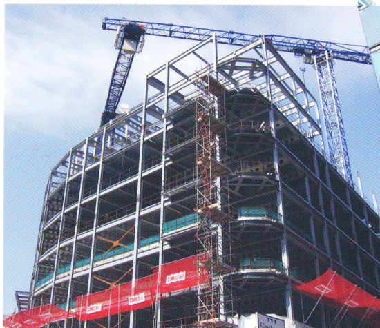
Balfour Beatty – Holborn Viaduct

Amec Balfour Beatty Construction Limited Balfour Beatty Refurbishment Limited Budge & Sons Ltd Chorus Group Coffey Construction Ltd Comer Homes Costain Ltd Crest Nicholson Fitzpatrick Contractors Ltd Geoffrey Osborne Ltd Gleeson Building Ltd Griffiths McGee Demolition Ltd Hill Partnerships Ltd Interserve (FM) Ltd ISG Dean & Bowes Ltd Killby & Gayford Ltd Knight Build Ltd Laing O'Rourke Ltd Lakesmere Ltd McNicholas Construction Services Ltd Mowlem Building Multiplex Pellikaan Construction ROK Group Ruddy Joinery Scheldebouw (UK) Ltd Skansen Ltd Skanska Rashleigh Weatherfoil Specialised Contract Interiors Limited Springdale Building Contractors St James Group St Mary's Demolition Contractors Ltd Thomas Bates & Son Ltd Urvasco