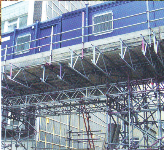
Costain – Saville Row