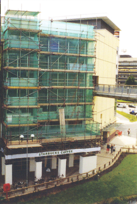
Balfour Beatty – Riverside Shopping Centre