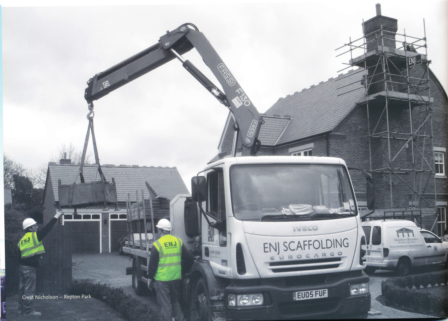
Crest Nicholson – Repton Park