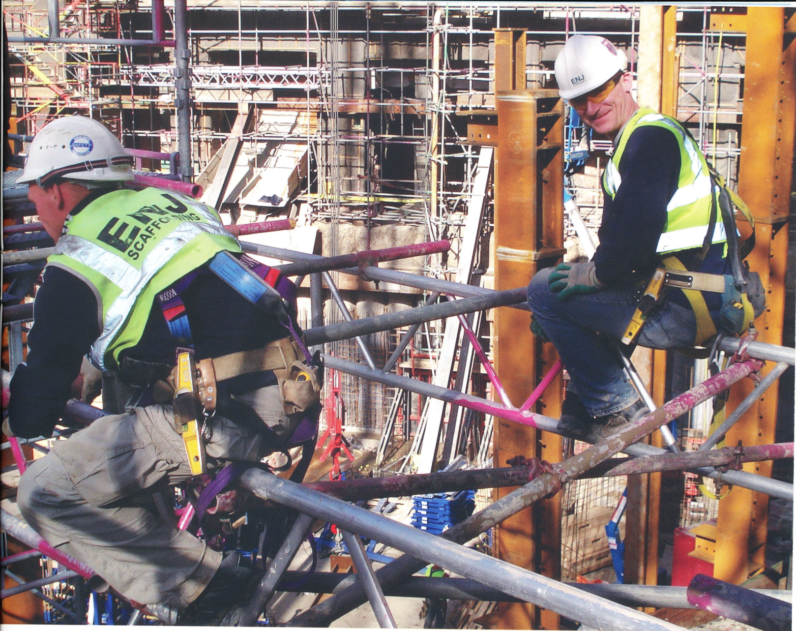
Urvasco – Silken Hotel Aldwych

Our site management and operatives actively participate and contribute in the production and evolution of method statements and risk assessments that ensures a total 'buy-in' to the agreed method of working